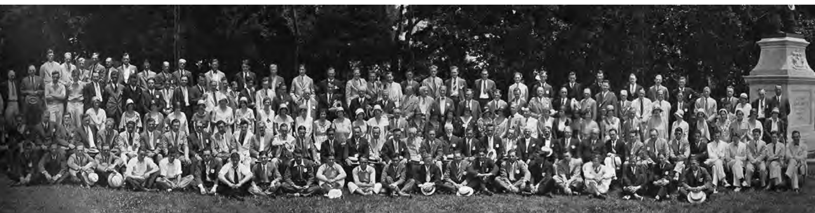
The 83rd Convention

Visit http://tdxconvention.org/ for registration information.