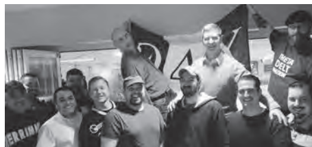
Alumni from Chi Triton (Merrimack) gather for their spring reunion to watch Hockey East competition.

For some of you, being a brother may have ended at graduation; for others, it may have simply faded with time. Yet I would imagine, that for most of you reading this, you feel something different. Perhaps your experience as an undergraduate forever changed the trajectory