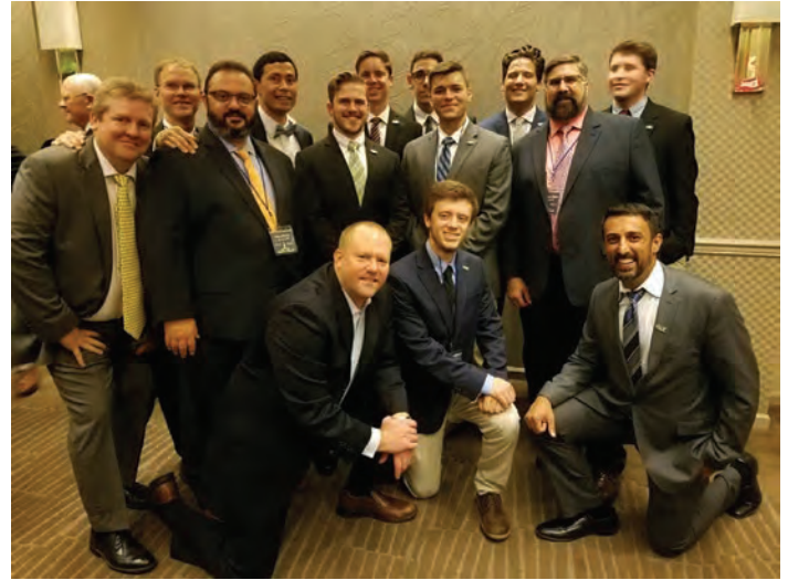
170th Convention Philadelphia, Rho Triton contingent

P.S. A special thank you to all Rho Tritons who were interviewed and congratulations to the newest initiates of the Rho Triton Charge who are pictured on the adjacent page. The re-chartering took place on March 17th in the Graduate Hotel in the same room they relinquished their charter in 2009.