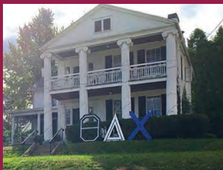
Theta Triton Charge House

Any Charge can do this. With the support of the right group of alumni (and the International Fraternity can help fill in any gaps with getting alumni support), with a little money, and with the right local financier, any Charge can get a house on a quick timetable. Even if a Charge doesn't have a house picked out, it's best to start having the alumni involved early and to start saving early. Ask any brother of Theta Triton: life is just better when you own the house, for so many reasons. It's an endeavor for sure—to form a company and buy a house for the Old Lady—but it's one to improve and reform, with an immeasurable reward at the end.