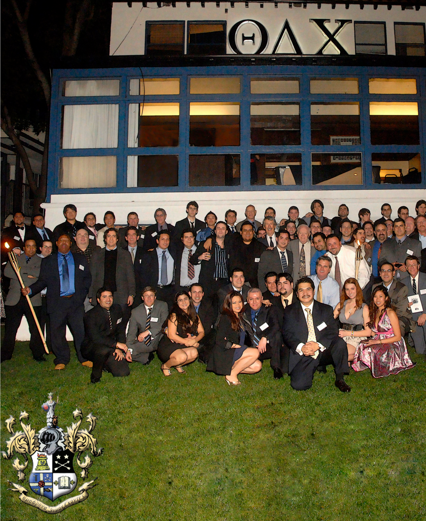
TDX CFO, 214 Lewis Wharf, Boston, MA 02110