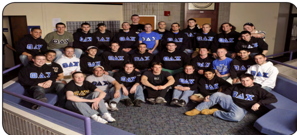
Brothers of Iota Triton

A very important aspect of the Iota Triton charge is maintaining a strong sense of brotherhood. Some ways that we have done so is brothers' night every week after our meetings on Mondays, where we meet up at Stone Forge to relax and enjoy each other's company. We have also for the third year in a row continued our TDXFL, where brothers create teams and battle it out on the football field. As a charge we are very excited to announce our first composite put together and passed out to each brother. Lastly, beginning this summer Iota Triton will be participating in Gillette stadiums fundraiser in order to raise funds for our charge. While doing so, we also hope to continue our strong bonds