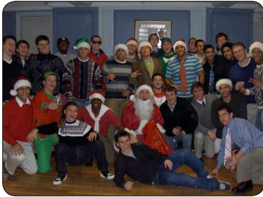
Brothers of Sigma Deuteron

for this upcoming year. We expect a great rush this coming fall after we transform our house into something to cherish this summer. We still have some debts to cover but we are confident we will be able to meet our obligations. Our new philanthropy chair is excited to get us more involved on campus and in our community, putting to good use our rising numbers. Our fraternity GPA was 3.125 over the year and ranked in the top half of fraternities on campus. Our focus on education, community, and brotherhood will surely make this coming year one to remember.