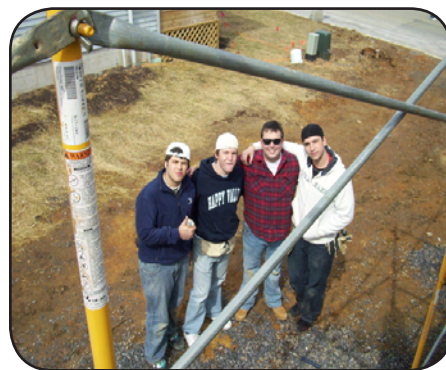
Active with Habitat for Humanity

has recruited very well in the past few years, bringing in hard working and great young fraternity men. We are proud to be very involved in outside organizations here at Penn State and many brothers even carry leadership positions in their respective organizations. From the Interfraternity Council President to cam-