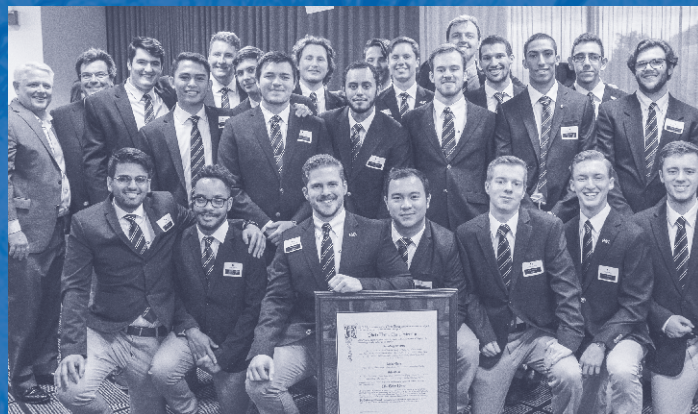
The most recent expansion was the re-chartering of the Rho Triton Charge (VCU) in 2018.

Theta Delta Chi is distinguishing itself as leaders in a time of uncertainty. We have used our values and belief in each other to change, adapt, and improve in this new colligate climate. At the Charge level we saw this emergence in the form of new virtual recruitment events, where Brothers and new members were able to form meaningful connections and relationships utilizing online platforms. We also saw online fundraisers where Charges raised funds for local COVID-19 relief efforts, social justice organizations, and other purposeful initiatives. At the international level, the CFO created and distributed Theta Delta Chi COVID-19 Guidelines to Charges, alumni associations, housing corporations and fraternity/