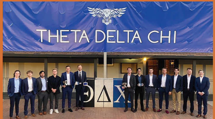
Psi Tetraton Executive Board

Theta Delta Chi gives me opportunities to share my voice, to be engaged, and to help our organization continue in endeavors to improve and reform. The stark reality for me is that we need to give people the opportunity to not only be a part of our beloved Fraternity, but to have a voice within it. In our communities, we need to be inclusive in our interactions and not just keep to ourselves. Reflecting back to the day I was rejected by the Latin American fraternity, I realized it wasn't necessarily that I was rejected, but perhaps, just the opposite; these organizations were created because fraternities that were historically white, didn't want to accept them. So, brothers, are we ready to build bridges and lead a movement? If so, let's speak with our actions, not our words.