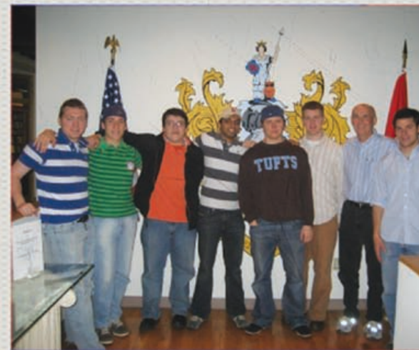
Inaugural Preamble Institute