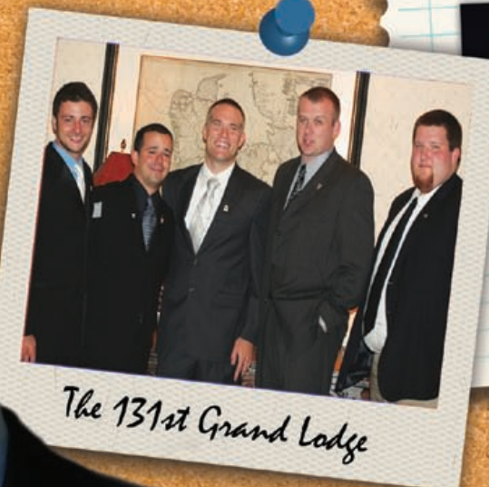
The 131st Grand Lodge