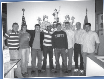
Each undergraduate was assigned to a different group or lodge during the Preamble Institute. These are the men of the Stars Lodge at the conclusion of the weekend.

The Delta Deuteron charge at UC Berkeley has already seen positive effects come as a result of the Preamble Institute. As new actives take their positions, the values and beliefs important to Theta Delta Chi are being emphasized and the use of new techniques is being implemented. Whether it be methods of goal setting or recruitment strategies, the Preamble Institute provided amazing insight for the improvement of our charge.