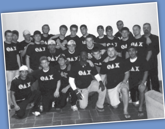
The men of the Tau Triton colony at Marist College in Poughkeepsie, NY show off their new Theta Delta Chi shirts.

Their addition and installation has been a perfect capstone to a phenomenal year for Theta Delta Chi. We look forward to a bridging of young and old when we formally present their Charter at this summer's Convention in Charlottesville, an event to commemorate the Nu Charge's 150 year anniversary at the University of Virginia.