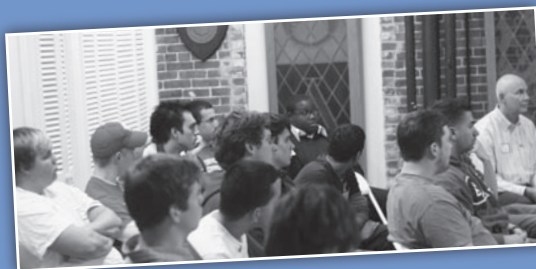
The undergraduates listen intently in one of the large group sessions on Friday evening.