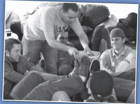
The Arrows Lodge takes part in a leadership exercise designed to stress the value of team-work.

—RORY MOUAT, Delta Deuteron '09 (Berkeley)