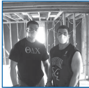
Masked and goggled against the dust, two undergraduates on site in a post-Katrina house.

our groups were involved in this step of the process. To see a home that had been waterlogged eight or ten feet high was so much more shocking than the news images to which many of us are accustomed. The watermarks on the walls are easily visible and drew numerous looks of amazement as students realized that the water had