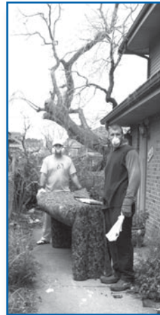
Cleaning up after Katrina.