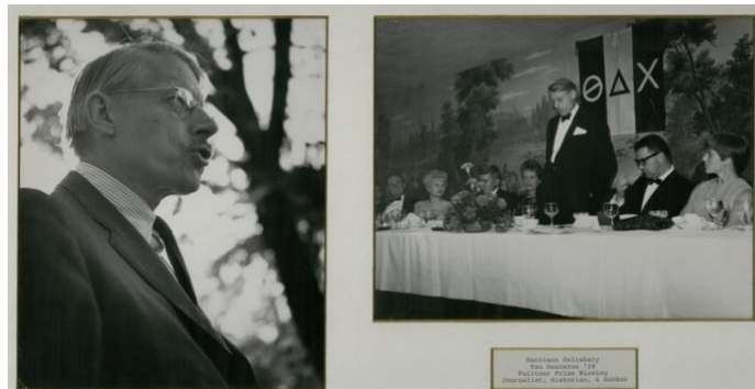
Fall 1967

Harrison Salisbury, Tau Deuteron 1929 (Minnesota) pledged during his freshman year and remained an active member of his Charge throughout his academic career. He was a reporter for the Minnesota Daily newspaper from 1927 until 1930. In 1930 he was the Managing Editor of the Newspaper. He was also involved in two other campus organizations, the Gray Friar Society, which was "A Senior fraternity of honor, interested in the general welfare of the University." He was also a member of Sigma Delta Chi, which later became the Society of Professional Journalists.