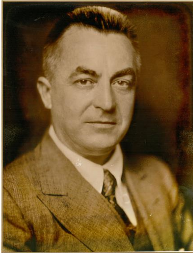
Raymond M. Hood Zeta '02 Architect, designer of Rockefeller Center, the Tribune Building and the Century of Progress Building in Chicago. One of the "creators of the modern skyscraper."