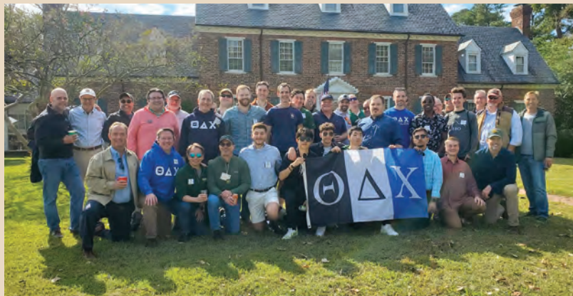
Brothers and refounding fathers of Epsilon in front of the old Charge House. This picture was from William & Mary's homecoming.

Following this call, I immediately walked into the William & Mary recreation center and convinced the workers to break policy and allow me to get a monthly guest pass. I made it my goal every day to connect with at least two people. I never mentioned that I was looking to restart a fraternity; I just wanted to make genuine connections with people that wouldn't normally be interested in Greek life, and continue to build those relationships the right way.